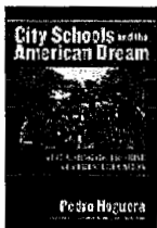
City Schools and the American Dream